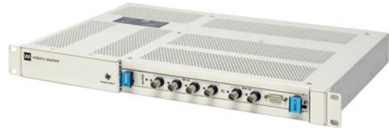
VM600 ABE056 slimline rack (housing a MPC4 machinery protection card)